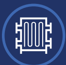
Plate-Plate Heat Exchanger